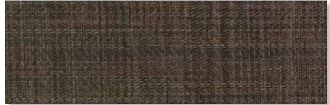
148147 tuff Width: 2500 mm