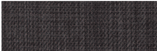
148148 slate Width: 2500 mm