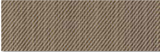
147145 chalk Width: 2500 mm