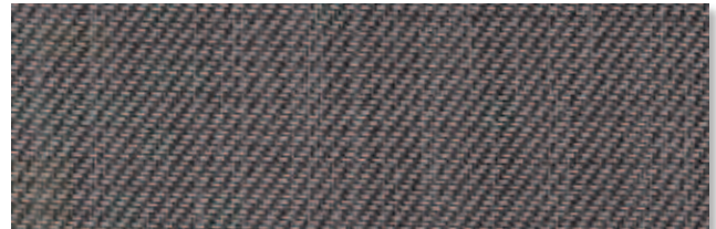
148149 limestone Width: 2500 mm