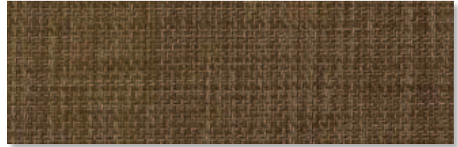
147147 dolomite Width: 2500 mm