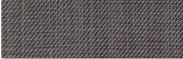
147149 quartzite Width: 2500 mm